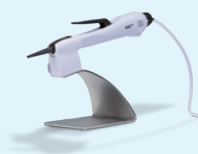
Table stand for VHC pro

Silicone tubing (minimum order quantity 2m).